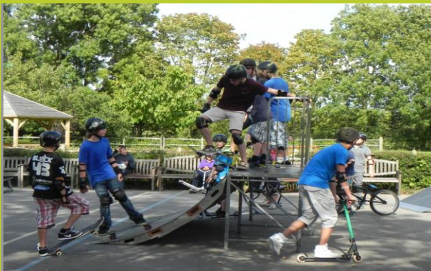
Skateboards, scooters & BMXs using the mobile skatepark

In the long-term we are looking at possible solutions to provide a permanent skate facility in the village. We are working with the Parish, District and County Councils to look at site options and funding possibilities.